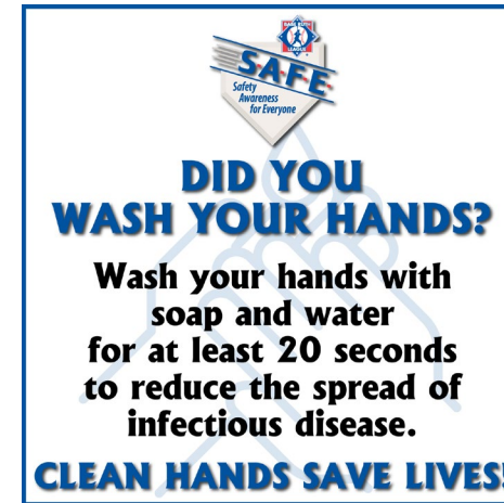
Reminder signage for restrooms, concession stands, park & dugouts