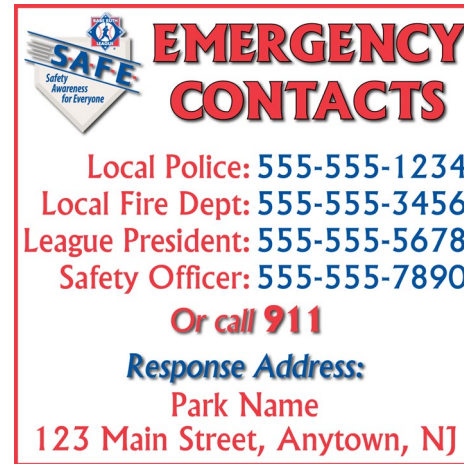
Emergency Contact List